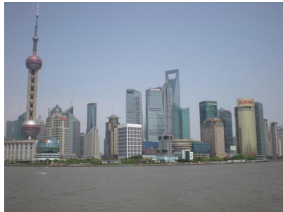
Shanghai's Skyline 'The Bund'

People's Square where the Hong Kong Shopping Centre is located.