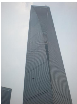
Shanghai World Financial Centre