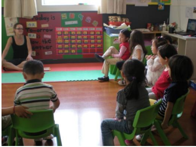
Hills Kindergarten Visit: Observing class