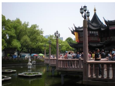
Yu Garden Zigzag Bridge

Today we were lucky enough to have the same people as the previous day, Freda and Vera, to show us around the Zhangning District. The morning included shopping at the Yuyuan Garden Tourist Mart which involved bartering, followed by a walk across the zigzag bridge (which encompasses nine turns as nine is viewed as a lucky number in China) and a visit to the Yu Garden. The Yu Garden features amazing Chinese gardening architecture which was originally built as a private garden. Following a delicious lunch and more shopping we made our way by the Metro to