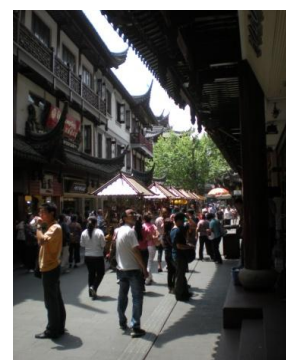
Yuyuan Garden Tourist Mart